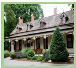
The Mesier Homestead

Pease donate to the Homestead Preservation Fund.