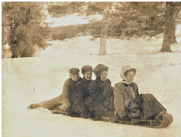
Sledding in Wappingers

The complete memoirs are archived in the Wappingers Historical Society's library at the Mesier Homestead.