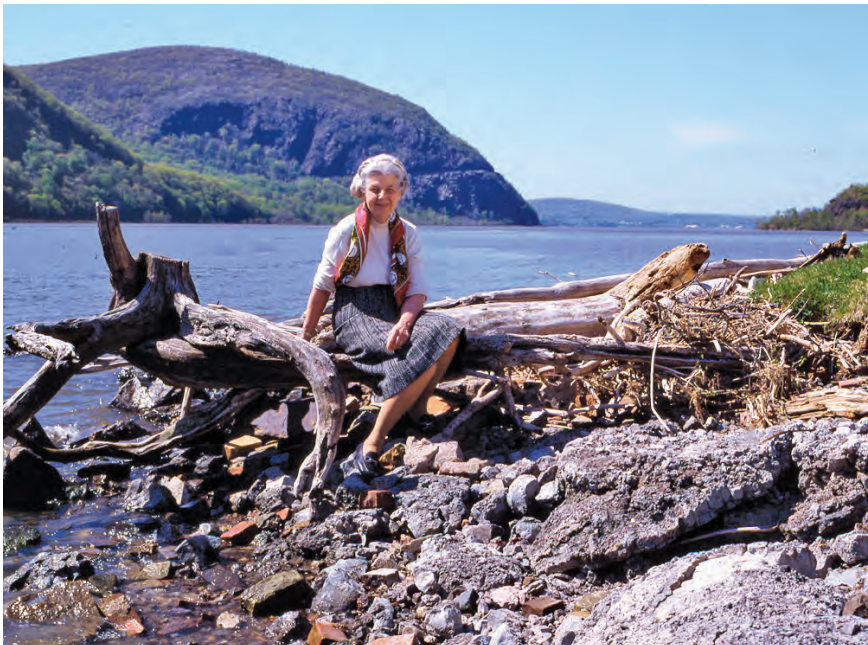
Figure 1. Franny Reese, “Defender of the Hudson Valley,” here seated at the edge of her beloved Hudson River with Storm King Mountain in the background. N.d. Photograph.

In fact, Franny Reese’s lasting contribution to history reverberates far beyond the region where she lived. Her unwavering commitment as a leader in the 17-year battle to defeat the construction of a huge hydropower plant on Storm King Mountain resulted in a landmark decision that is considered to be the basis of modern environmental law in the United States: Scenic Hudson Preservation Conference v. Federal Power Commission .